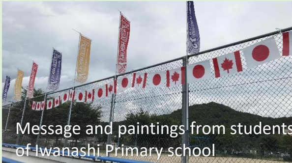
Message and paintings from students of Iwanashi Primary school