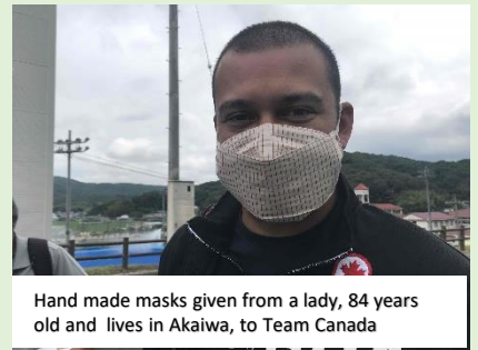
Hand made masks given from a lady, 84 years old and lives in Akaiwa, to Team Canada