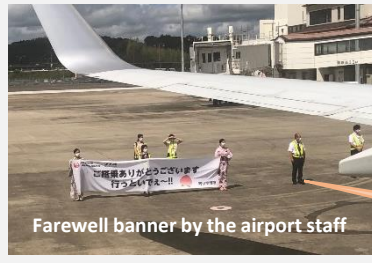
Farewell banner by the airport staff

"Good luck" message written with water spray by the airport staff!